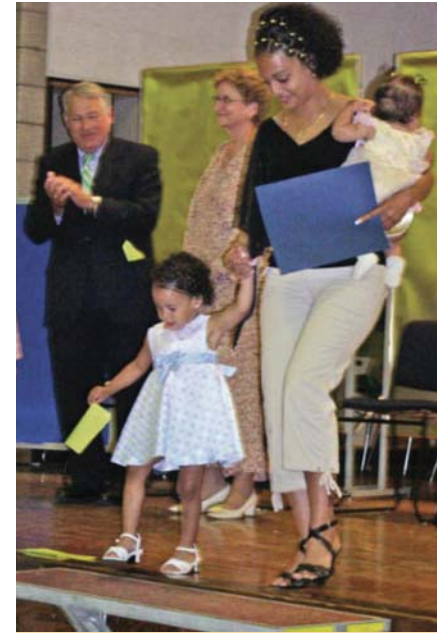
FAMILY LITERACY GRADUATES