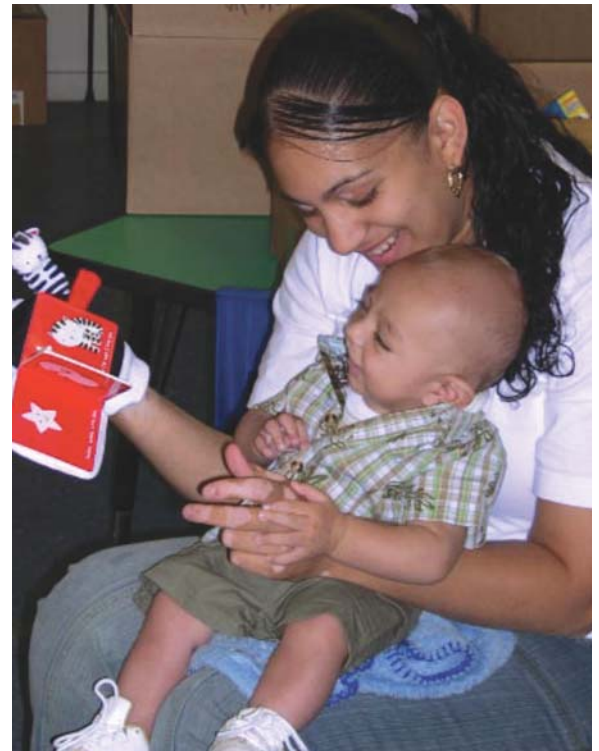
FUN WITH READING AND EACH OTHER