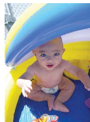
ENJOYING THE OUTDOORS

BCF serves as the Family Networks Area Lead Agency in the DCF Pittsfield and Greenfield Area Offices covering many rural and urban communities in Western MA. BCF partners with the Area Offices to develop local networks of services and community collaborations to support children and families to reach outcomes of safety, permanency and well-being. BCF staff members organize and facilitate family team meetings; families and children have an active voice in identifying services that enhance their own strengths and resources. BCF is responsible for service referral, utilization, and educational consultation for three types of services purchased by DCF from private providers: community-based Support and Stabilization Services, Intensive Foster Care, and Congregate (Residential) Care placements.