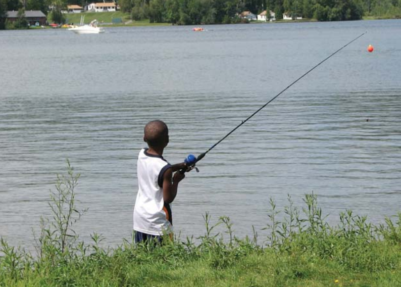
FISHING AT HEALING HOMES PICNIC